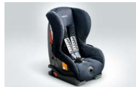
94 | Childseat SUBARU Duo plus