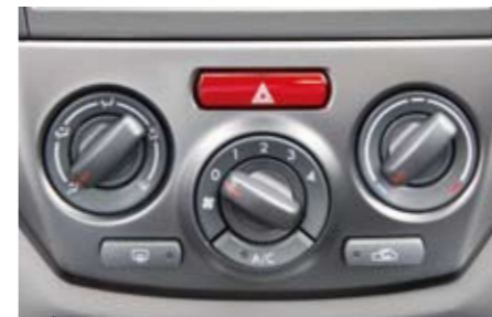
80 Air conditioner kit (L.H.D.) G3010SC310

Includes electronic compass. Mirror darkens automatically when headlights are detected from the rear of the vehicle. *Requires an adapter kit: H5010SC000. R.H.D. vehicle also requires a Mounting adapter: H501SSA040.