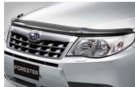
21 Hood deflector E235ESC000

Durable acrylic plastic and wraparound design help protect the hood from stone chips.