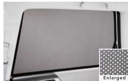
49 Sunshade (Rear side)

The perfect fit, and a brilliant finish.