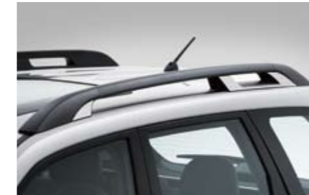
13 | Roof rail moulding E755ESC700 Brushed silver finished mouldings add highlights to the roof rail area.