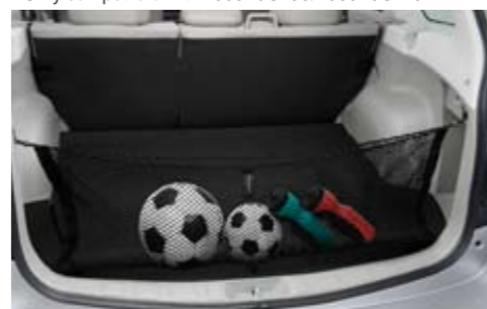
59 Cargo net (Rear gate)

Extra protection for the luggage space. Suitable for fishing and hunting.