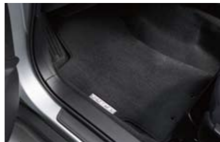
70 Carpet mat Black, Premium J505ESC201, J505ESC201RH

Replaces existing sill plates with a more sporty look. *Front & Rear set.