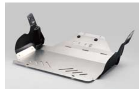
33 Engine under guard (Aluminium) E515ESC200 / E515ESC301

Protects differential from protruding rocks and stones. *Installation kit required.