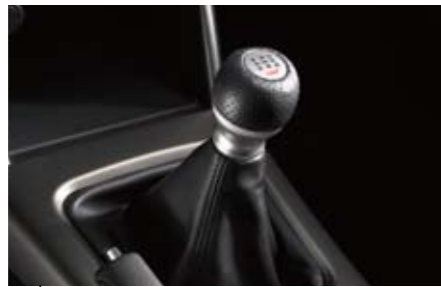
76 STI Shift knob, Aluminium & leather (5MT) C1010FG000

Stylish aluminium shift knob with Subaru logo.