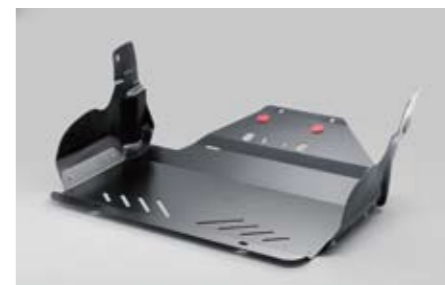
34 Engine under guard (Steel) E515ESC000 / E515ESC101

Protects engine and sump guard from protruding rocks and stones. *Installation kit and plastic side parts required.