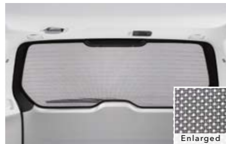
51 Sunshade (Rear gate)

Protects from sunshine and darkens your luggage space. Mesh type.