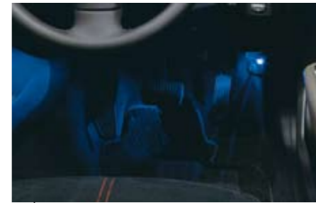
84 Twin foot lamp H7010SC000

Cup type ashtray exactly fits the centre cup holder. *F6010SC000: for AT, MT.