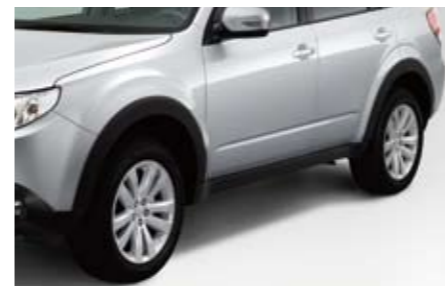
27 Fender flares J105ESC100

Helps protect your vehicle from mud and snow.