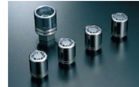
20 | Wheel lock kit B327EYA000 Helps prevent alloy wheel and tyre theft.

Image: vehicle is presented with Fog lamp kit and 16" alloy wheels.