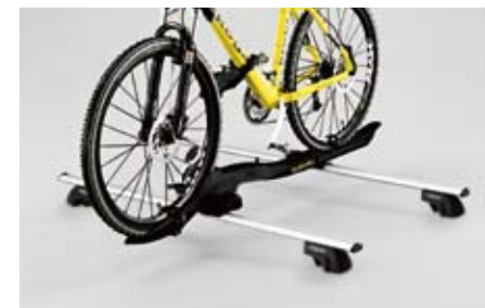
45 Bicycle holder (Barracuda) E361ESA501

Fits perfectly on the carrier base. *Carrier base required.