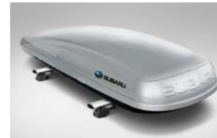
39 Transport box (Long) E361EYA900

Enhances your load carrying drastically. *Carrier base required.