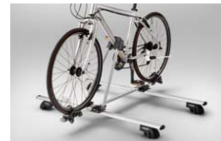
44 Bicycle holder (Basic) E365ESC100

For 4 sets of skis or 2 snowboards. *Carrier base required.