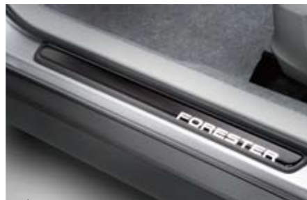
68 Piano black side sill moulding E755ESC600

Replaces existing sill plates with a more sporty look. *Front & Rear set.