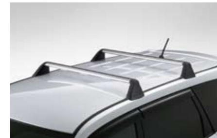
37 Aluminium carrier base (without roof rail) E3610SC500

Perfectly fitting stylish base for carrier attachments.