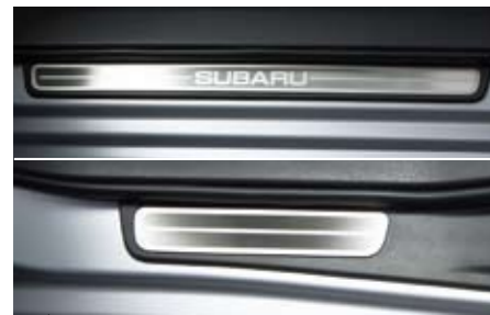
67 Side sill plate E1010FG000

Replaces existing sill plates with a more sporty look. *Front & Rear set.