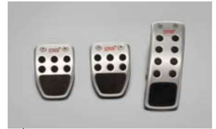
86 STI pedal pad kit (MT, L.H.D.) C8110FG000

Sporty looking set of pedals made of aluminium. *Not available for vehicle equipped with aluminium pedals.