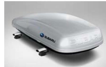
40 Transport box (Short) E361EYA801

Size: 2,267 x 805 x 355 mm. Volume: 430 litres. *Carrier base required.