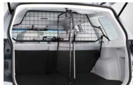
53 Dog guard divider (K/M)

Handy to separate luggage and to avoid it from sliding. *Luggage utility rail & hook required.