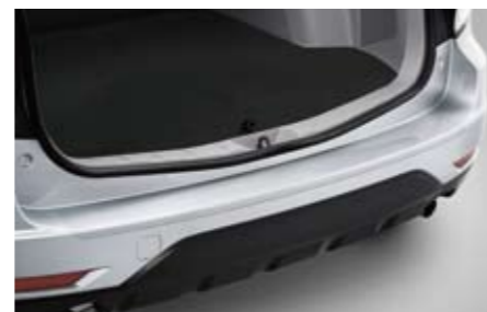
31 Cargo step protection foil (Clear) E775ESC100

Rugged plastic resin cover helps protect upper surface of rear bumper.