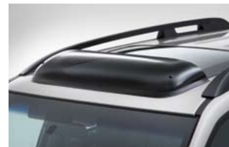
28 Sunroof deflector F541SSC000

Enhances the rough road image of your vehicle. *Not compatible with under spoiler.