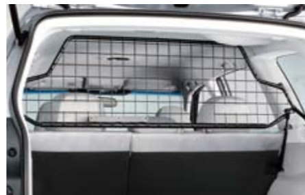
52 Dog guard (K/M)

Protects from sunshine and darkens your luggage space. Mesh type.