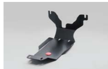
32 Rear differential guard E515ESC400

Helps protect upper surface of rear bumper.