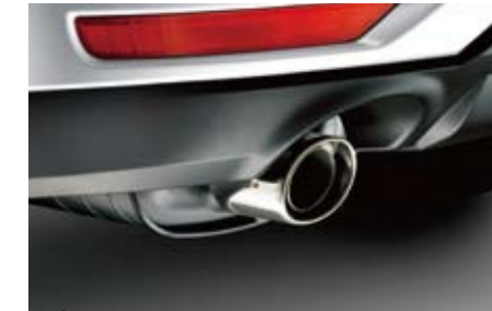
16 | Muffler cutter D0518FG010 Stainless steel chrome extension for sporty look.