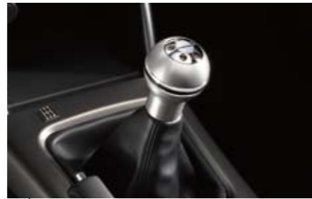
73 Aluminium sport shift knob, Black (5MT) C105EFE000

Heavy duty rubber mat protects carpet from mud and snow. *Front & Rear set. J505ESC003: for L.H.D. vehicle. J505ESC004RH: for R.H.D. vehicle.