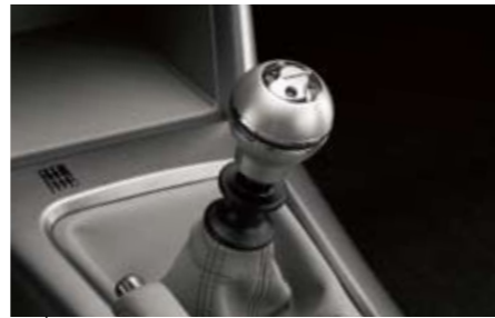
74 Aluminium sport shift knob, Black (6MT) C105ESC000

Stylish aluminium shift knob with Subaru logo.