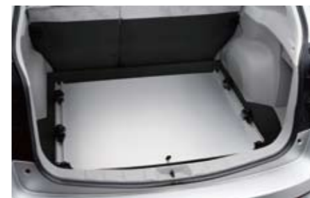
66 Luggage floor panel

Two bicycles with their front wheels removed can be stored even with 2 passengers in the car. *Luggage utility rail & hook required.