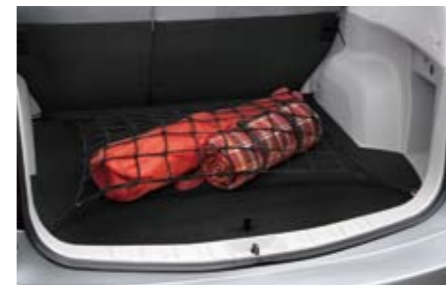
62 Cargo net (Floor)