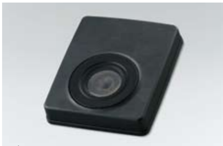
89 | Subwoofer / Amplifier

Special speakers enhance high-frequency audio. *For factory installed 1-CD audio.