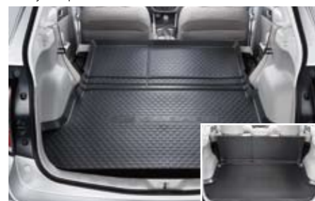
57 Cargo tray foldable

The floor panel is coated with aluminium that is easy to wipe clean, protecting the luggage space from dirt. *Luggage utility rail & hook required.