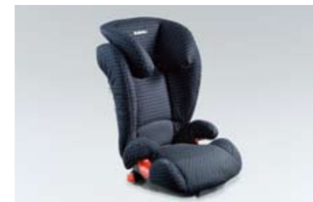
95 | Childseat SUBARU KIDFIX