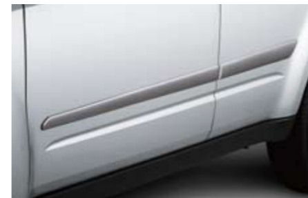
23 Side moulding J101SSC000NN

Helps protect your vehicle from stone-chips. *Not compatible with Front under spoiler.