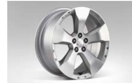
18 | Alloy wheel 5-spoke (17 inch) 28111SC041 17x7JJ offset 48 215/55R17, 225/55R17