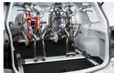
65 Luggage bicycle holder

Protects luggage space floor from dust and dirt.