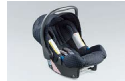
92 | Childseat SUBARU Baby safe plus

Secure installation by ISOFIX. Extra protection in case of side impact.