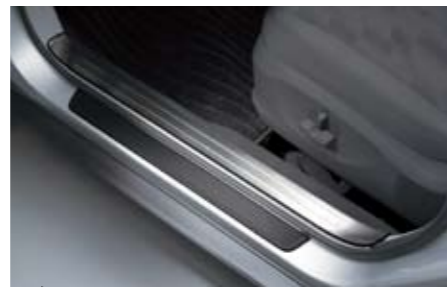
69 Side sill plate -Inner E1010SC100

Stylish piano black finished mouldings with Forester logo give a very elegant touch to the side sill area. *Front & Rear set.