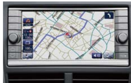
90 | DVD-Navigation kit (L.H.D., R.H.D.)

Adds 120 watts of power, and delivers super bass sound you not only hear but feel. *Not compatible with factory installed Subwoofer.