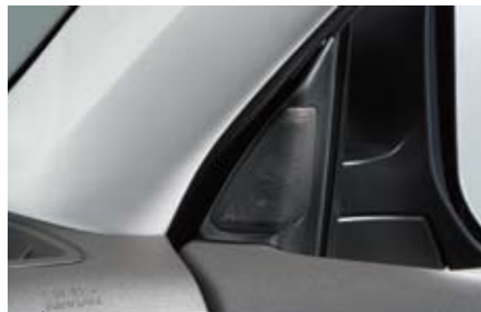
88 | Tweeter kit for 1-CD Audio