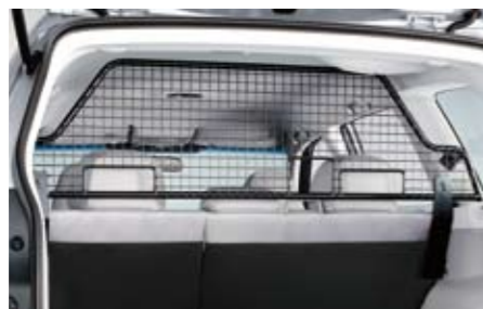
54 Dog guard (G/M)

Splits the luggage space into two sections, allowing two dogs to be held separately or for one dog to be separated from the luggage. *Only compatible with F555ESC000/F555ESC010.