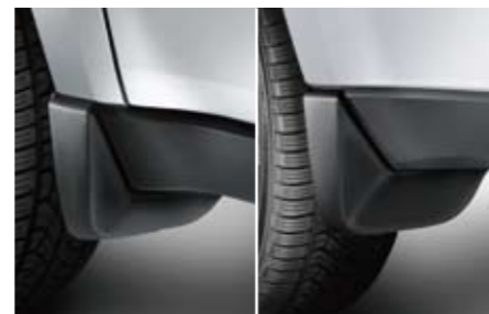
26 Splash guard (Front, Rear) J1010SC001, J1010SC004

Protects bumper corners. *Front and Rear set.