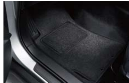
71 Carpet mat Black, Standard J505ESC101, J505ESC101RH

Changes the accessory socket to a cigarette lighter.