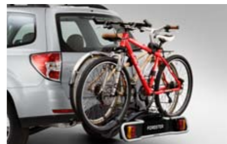
46 Rear bicycle holder (2 bikes) E365EFJ100 / E365EFJ200

Bike holder with aerodynamic design, easy bike installation. *Carrier base required.