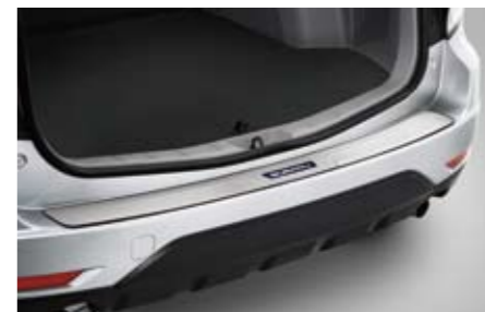
29 Cargo step panel (Stainless) E7710SC000

Helps reduce wind noise and cuts sun glare.