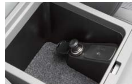
82 Cigarette lighter kit H6710FG000

Helps reduce dust and pollen infiltration into the vehicle cabin area. For the best result, it is recommended to replace the filter once a year or every 15,000 km. *For the replacement of originally equipped filter.