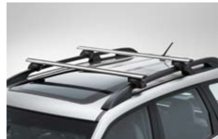
36 Aluminium carrier base (with roof rail) E365ESC000

Perfectly fitting stylish base for carrier attachments.