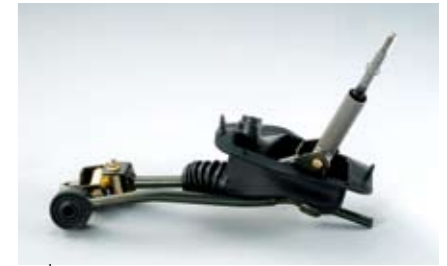
87 STI quick shift linkage 5MT C1010SC100, C1010SC000

Sporty looking set of pedals made of aluminium. *Not available for vehicle equipped with aluminium pedals.