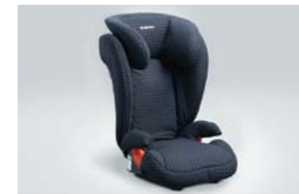
96 | Childseat SUBARU KID