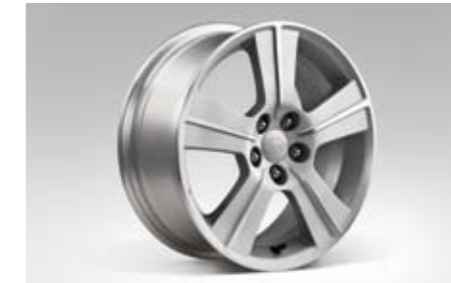
19 | Alloy wheel 5-spoke (16 inch) 28111SC010 16x6.5JJ offset 48 215/65R16