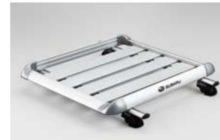
38 Roof rack platform E365ESC200

Perfectly fitting stylish base for carrier attachments.