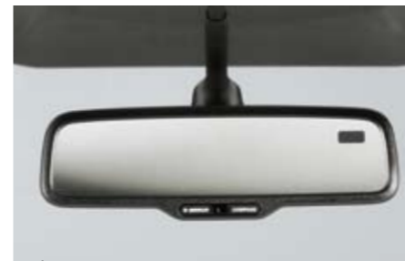
79 Compass mirror (L.H.D., R.H.D.) H501SSA101, H501SAG300

Custom fitted carpet mat with logo. *Front & Rear set. J505ESC201: for L.H.D. vehicle. J505ESC201RH: for R.H.D. vehicle.