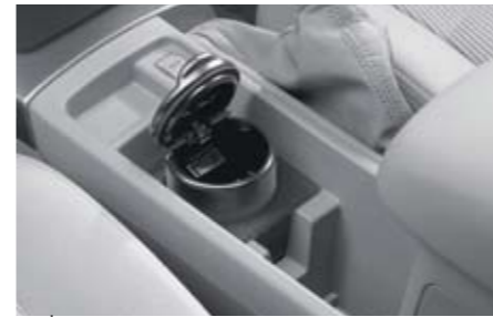
83 Round type ashtray F6010SC000

Stylish aluminium shift knob with Subaru logo.