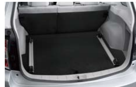
63 Luggage utility rail & hook