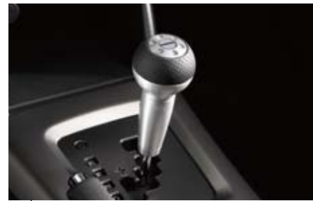
75 Aluminium sport shift knob (AT) C101ESA002

Turns on automatically when the front door is opened or closed to light up the area around your feet. Makes getting in and out of the car in dark areas much easier. *Requires an installation kit: H0070SC100.