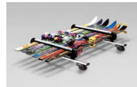
42 Ski attachment (Maximum 6 sets) E361EAG550

For 6 sets of skis or 4 snowboards. Usable width: 640 mm. *Carrier base required.