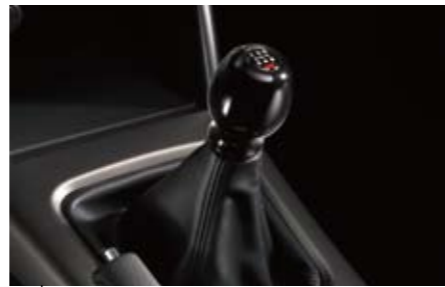
78 STI Shift knob, Duracon (5MT) C1010FG300

Stylish leather shift knob with STI logo.