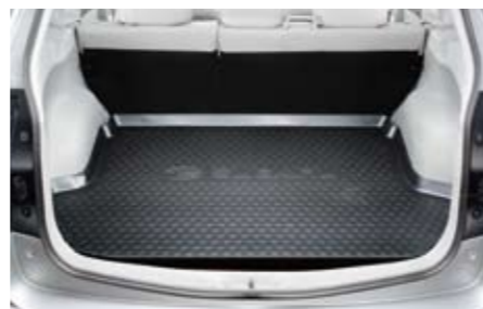
56 Cargo tray

Splits the luggage space into two sections, allowing two dogs to be held separately or for one dog to be separated from the luggage. *Only compatible with F555ESC200/F555ESC210.