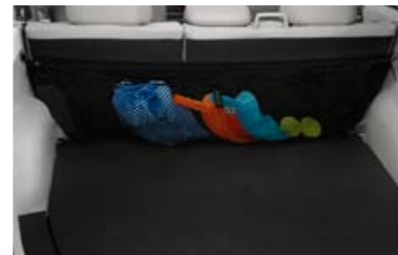
61 Cargo net (Seat back)

Separates luggage space from passenger area, applicable for ISOFIX child seat. *F555ESC000: for vehicle with sunroof. F555ESC010: for vehicle without sunroof.