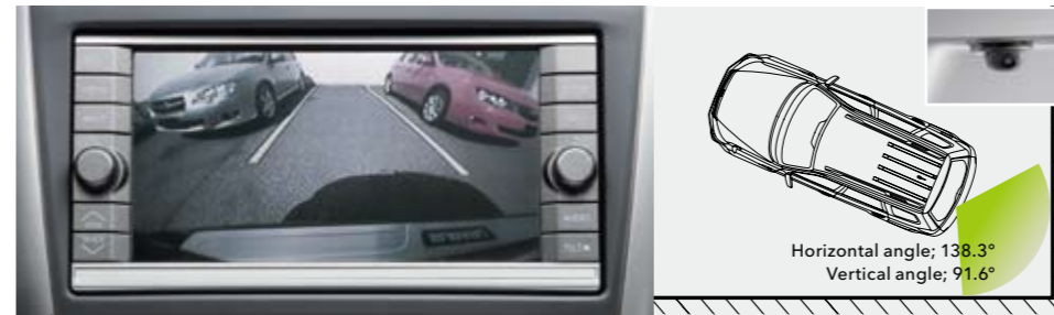
91 | Rear view camera

Exclusive design, user-friendly operation with touch screen and easy destination input. Includes radio, CD player, and DVD player. Bluetooth®* handsfree pre-arranged. *Map is available only for the European countries.