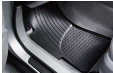
72 Rubber mat J505ESC003, J505ESC004RH

Custom fitted carpet mat with logo. *Front & Rear set. J505ESC101: for L.H.D. vehicle. J505ESC101RH: for R.H.D. vehicle.