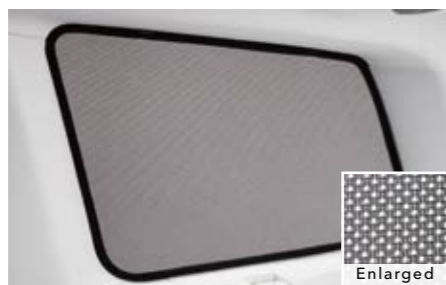
50 Sunshade (Rear quarter)

Protects from sunshine and darkens your passenger area. Mesh type.