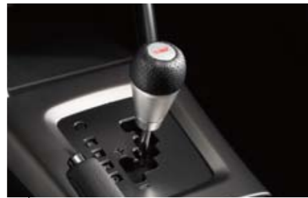
77 STI Shift knob (AT) C1010FG200

Designed for premium sports driving. Provides outstanding grip and vibration control.