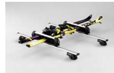
43 Ski attachment (Maximum 4 sets) E365EAG500

For 6 sets of skis or 4 snowboards. Usable width: 640 mm. *Carrier base required.