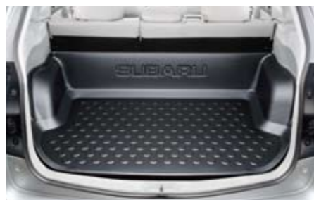
58 Deep cargo tray

Protects luggage space floor from dust and dirt. Also offers extra protection when the rear seats are folded flat.