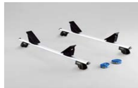
41 Kayak attachment E361EAG600

Size: 1,792 x 797 x 355 mm. Volume: 380 litres. *Carrier base required.