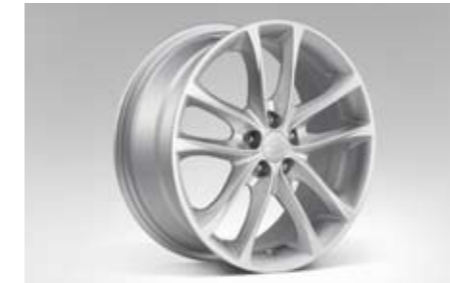
17 | Alloy wheel 10-spoke (17 inch) B3110SC100 / B3110SC100K 17x7JJ offset 48 215/55R17, 225/55R17