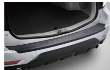
30 Cargo step panel (Resin) E775ESC000

Rugged plastic resin cover helps protect upper surface of rear bumper.