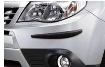
25 Bumper corner protector J105ESC000

Helps protect your vehicle from stone-chips. *Not compatible with Rear under spoiler. Cut-out required for Trailer hitch.