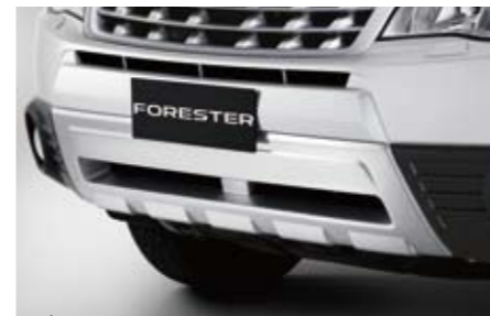
22 Front bumper under guard E551SSC000

Durable acrylic plastic and wraparound design help protect the hood from stone chips.