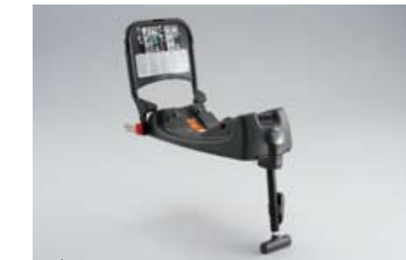
93 | Childseat SUBARU Baby safe ISOFIX base

Extra protection in case of side impact.