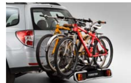
47 Rear bicycle holder (3 bikes) E365EFJ300 / E365EFJ400

Transports 2 bikes on tow ball. *Trailer hitch needed. E365EFJ100: for 7 pin, E365EFJ200: for 13 pin.