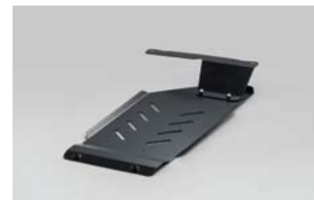
35 Transmission under guard (AT) E515ESC500

Protects engine and sump guard from protruding rocks and stones. *Installation kit and plastic side parts required.