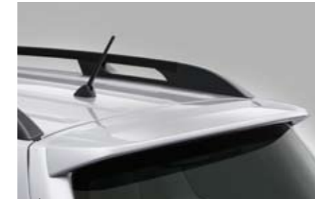
14 | Roof spoiler kit E7210SC000NN Primed roof spoiler adds a sporty touch to your vehicle. *Painting required.