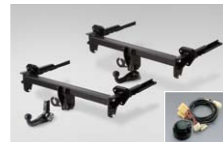
48 Trailer hitch (Detachable, Fix) See application list

Transports 3 bikes on tow ball. *Trailer hitch needed. E365EFJ300: for 7 pin, E365EFJ400: for 13 pin.