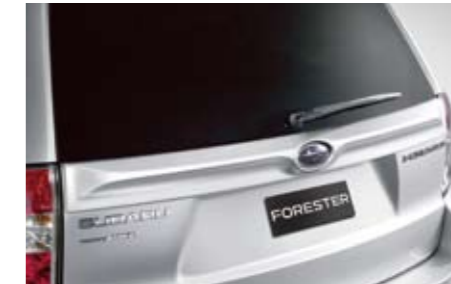
15 | Waist spoiler J1210SC000NN Enhances the sporty look. *Painting required.