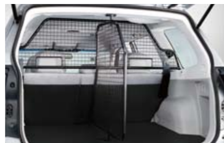
55 Dog guard divider (G/M)

Separates luggage space from passenger area, applicable for ISOFIX child seat. *F555ESC200: for vehicle with sunroof. F555ESC210: for vehicle without sunroof.