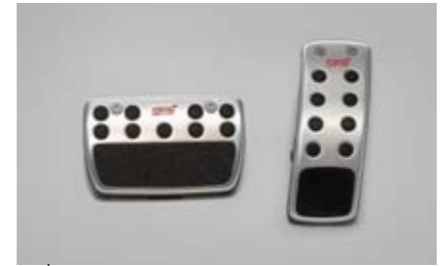
85 STI pedal pad kit (AT, L.H.D.) C8110FG010

FHI and STI have collaborated in order to create a concept of "total tuning" to emphasise the performance of the original vehicle.