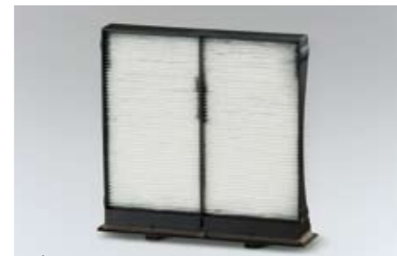
81 Air filter 72880FG000

After-fitment air conditioner. *Requires an AC fan kit: G3010SC500.