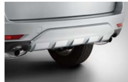
24 Rear bumper under guard E551SSC100

Helps protect body side. *J101SSC000NN: primed.