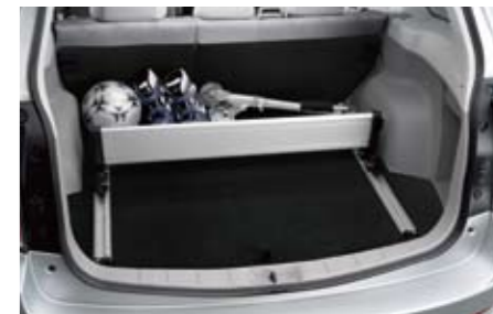
64 Luggage partition

Used in conjunction with the luggage partition, bike carrier and floor panel.